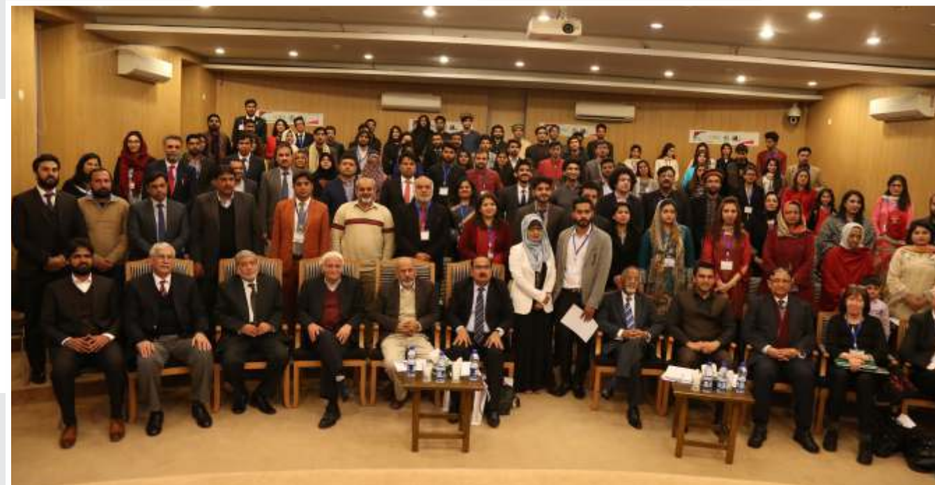
INTERNATIONAL MEDIA CONFERENCE - 2019